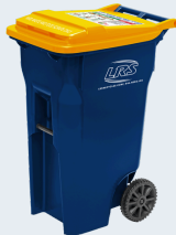
YARD WASTE & ORGANICS